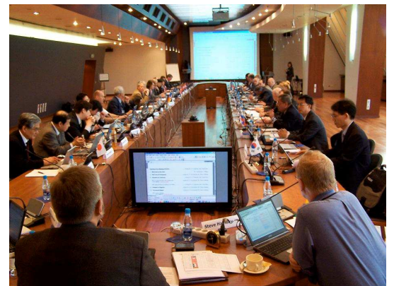
ISO/IEC JTC 1/SC 31 committee