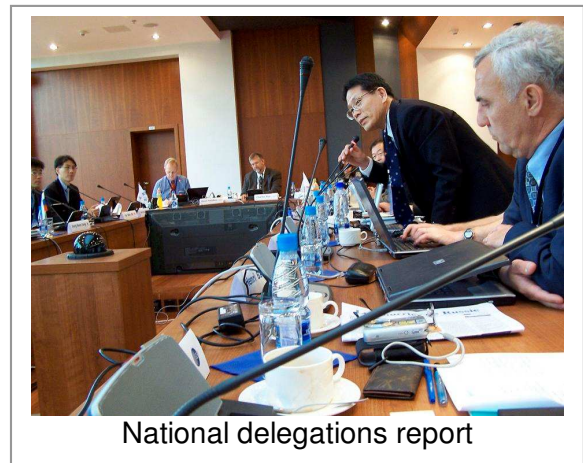
National delegations report

❖ Japan suggested a new work item for the development of specifications for RFID MIDDLEWARE. The Japan delegation was accompanied by representatives of the Ministry of Economy, Trade and Industry - Information Economy Division. The delegate presented the support program for RFID and suggested to address the standardisation of the “middleware” under ISO as well. It shall utilise existing infrastructures as first priority. JTC1/SC31 encouraged other National Bodies to make similar contributions to the final resolutions.