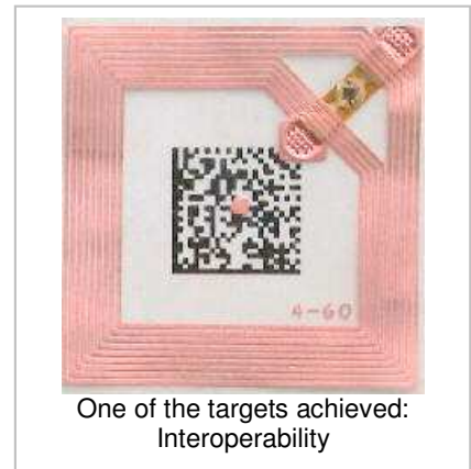
One of the targets achieved: Interoperability

Convenors, project editors and secretariat manage the progress under the rules of ISO/IEC JTC 1. Presently 14 project editors have been appointed for drafting the current specifications subject to the work process.