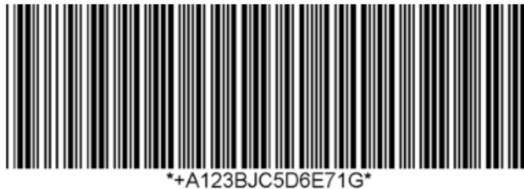
Figure 2. Code 39

Note: the figures in this document are here as examples only, and due to the nature of the document their resolution may not conform to the specifications that are needed when using these symbols in a working environment