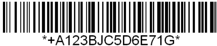
Figure 1. Code 128

Shown below are examples of the symbols for the HIBC LIC Primary Data Structure.