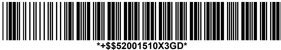
Figure 6. Code 39