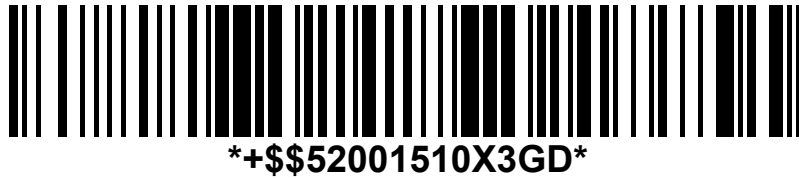
Figure 5. Code 128

Shown below are examples of the symbols for the HIBC LIC Secondary Code Data Structure. They are based on the primary message in example 4.3.1, +A123BJC5D6E71G. In this case, the Link character ('L' in table 2) is G, and the Check character in the example below is D.